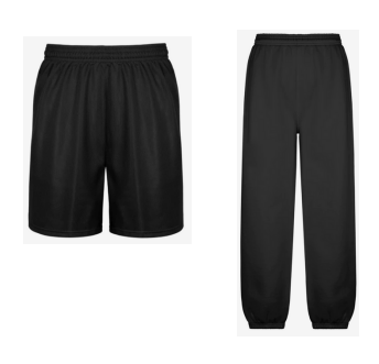
Black Gym Shorts or Black Sweatpants