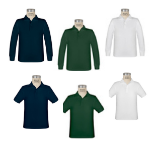
Navy, Green, or White Polo

-No jeans/denim, corduroy, joggers, cargo pants, skinny/tight fit, droopy waists, jeggings -Navy from DU only -Khaki from Store of Choice